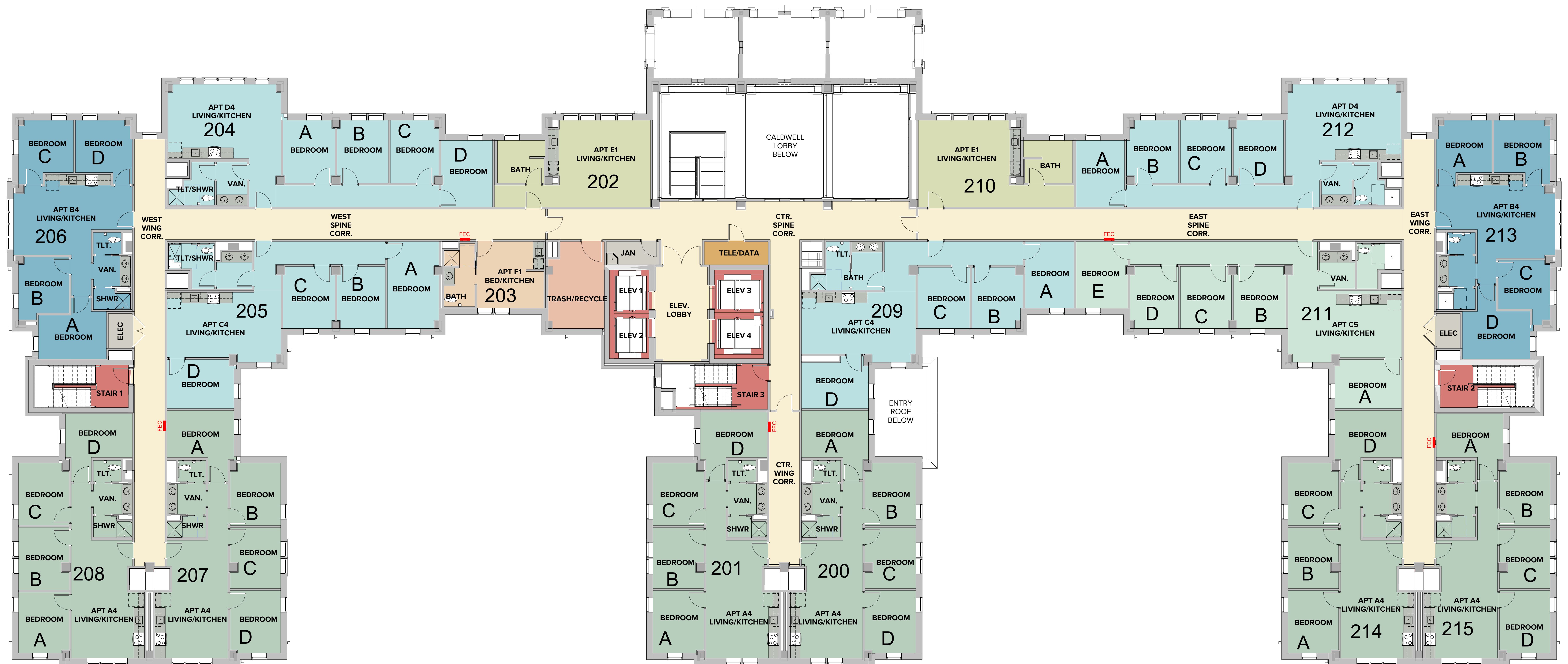
2ND FLOOR PLAN SCALE: 1/8" = 1'-0"