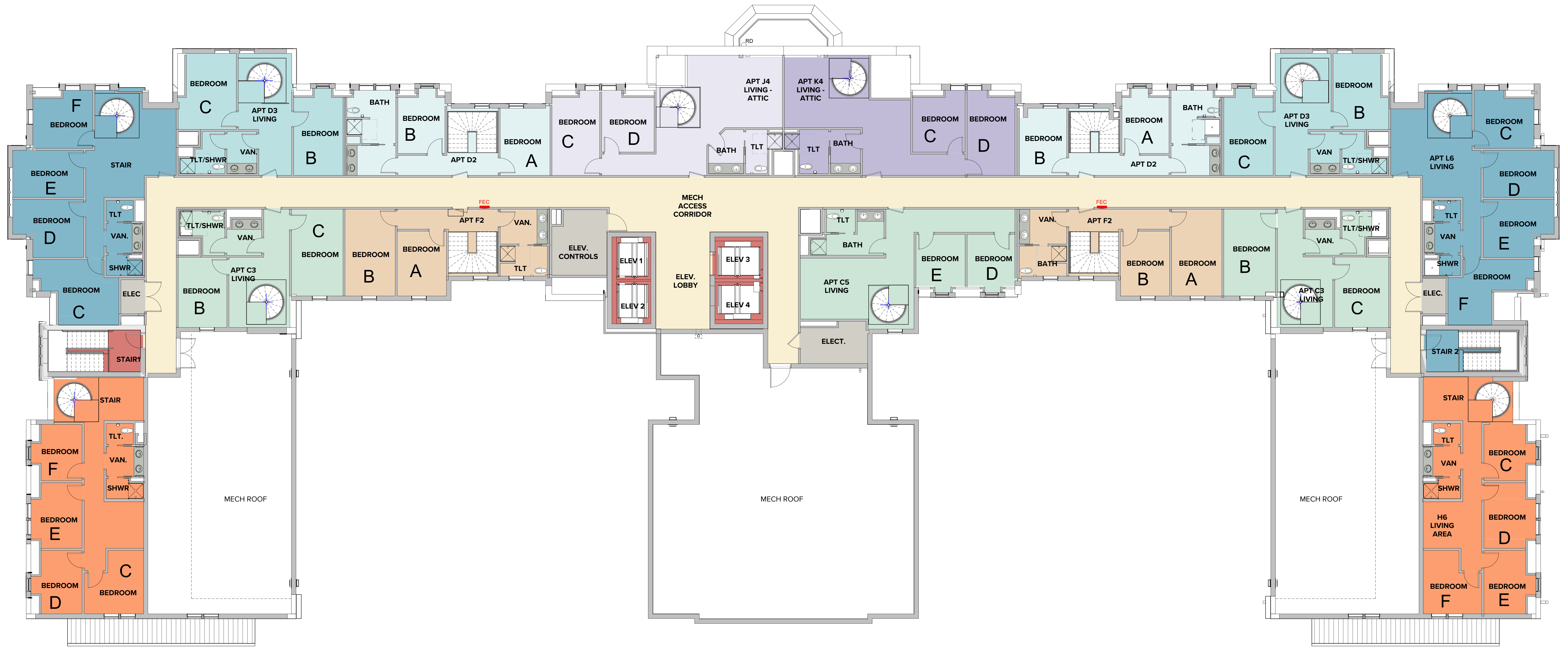
ATTIC PLAN SCALE: 1/8" = 1'-0"